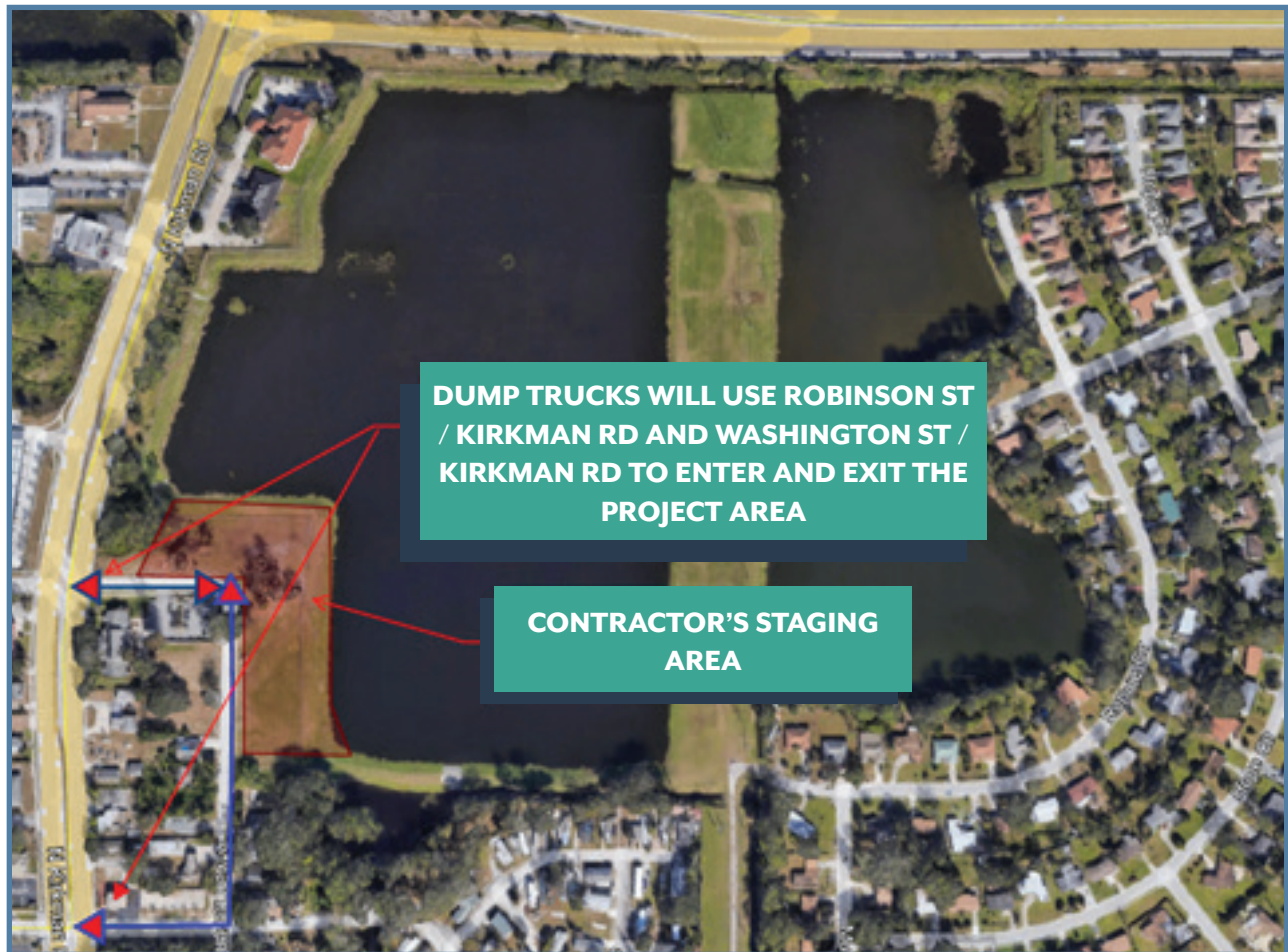
Figure 2 - Haul Routes